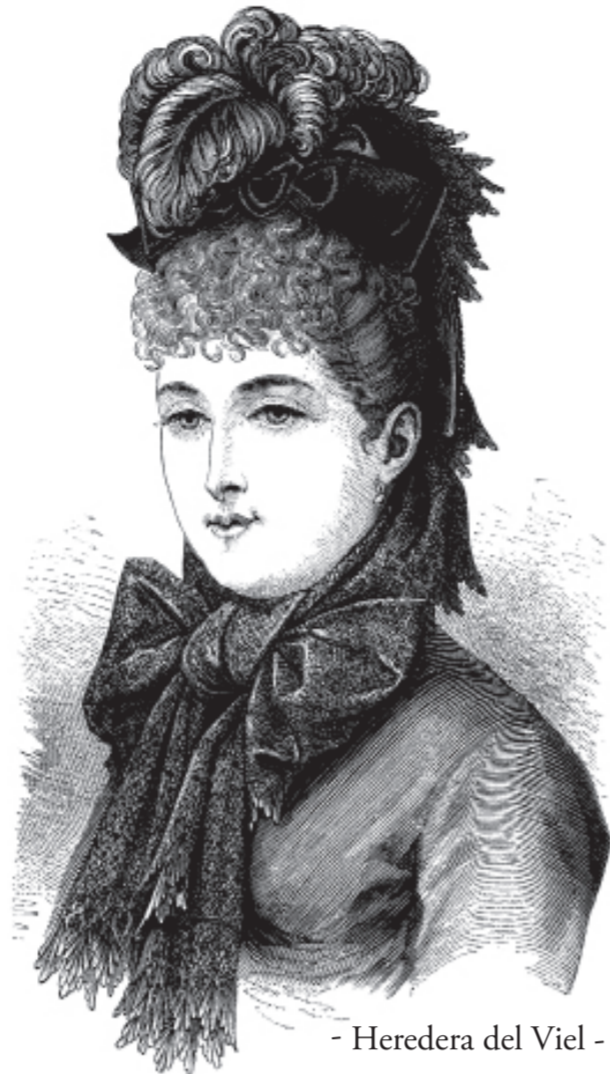
- Herederas del Viel -